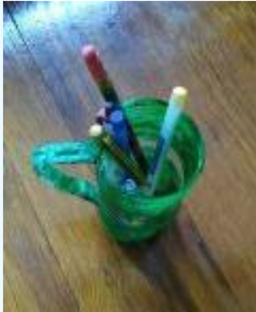
Ashley Alvizures 4 V/G- Upcycling remote learning 20'