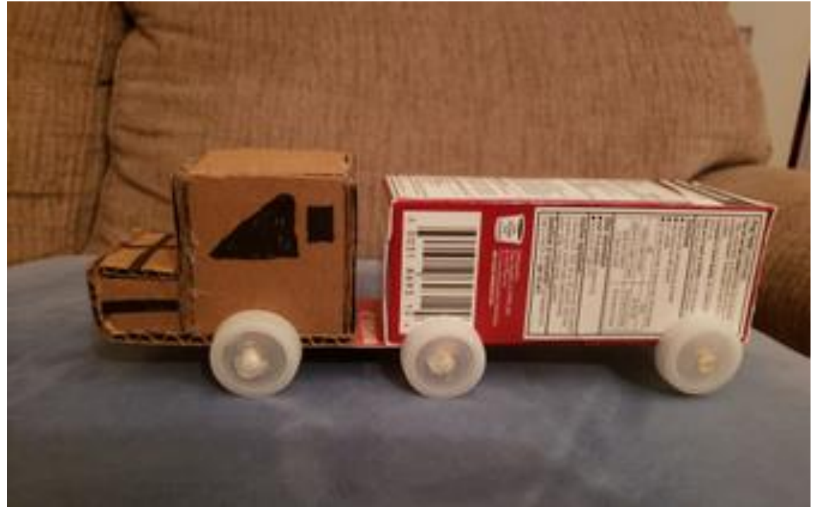
Upcycling remote learning 20'

Wow Mathew! What a great looking tractor trailer. You used so many recyclables, cardboard, cartons, and plastic. What kind of products are you hauling? You could put picture details of those products on the side of your truck if you wanted to identify what is being transported by your truck. I bet with enough time you could make a whole convoy of trucks to play with!