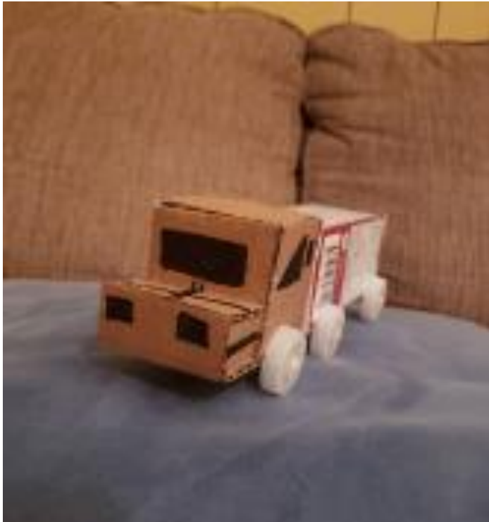
Mathew Rodriquez- Grade 1 G/K

Teacher reply: Litzy I love the birds eye view of the 7 containers it looks like a flower design! The Earth day theme that you put around the outside was so clever. I like how you used the blue painter's tape as the ocean water. Its so nice you know have a place to store all you supplies for online learning