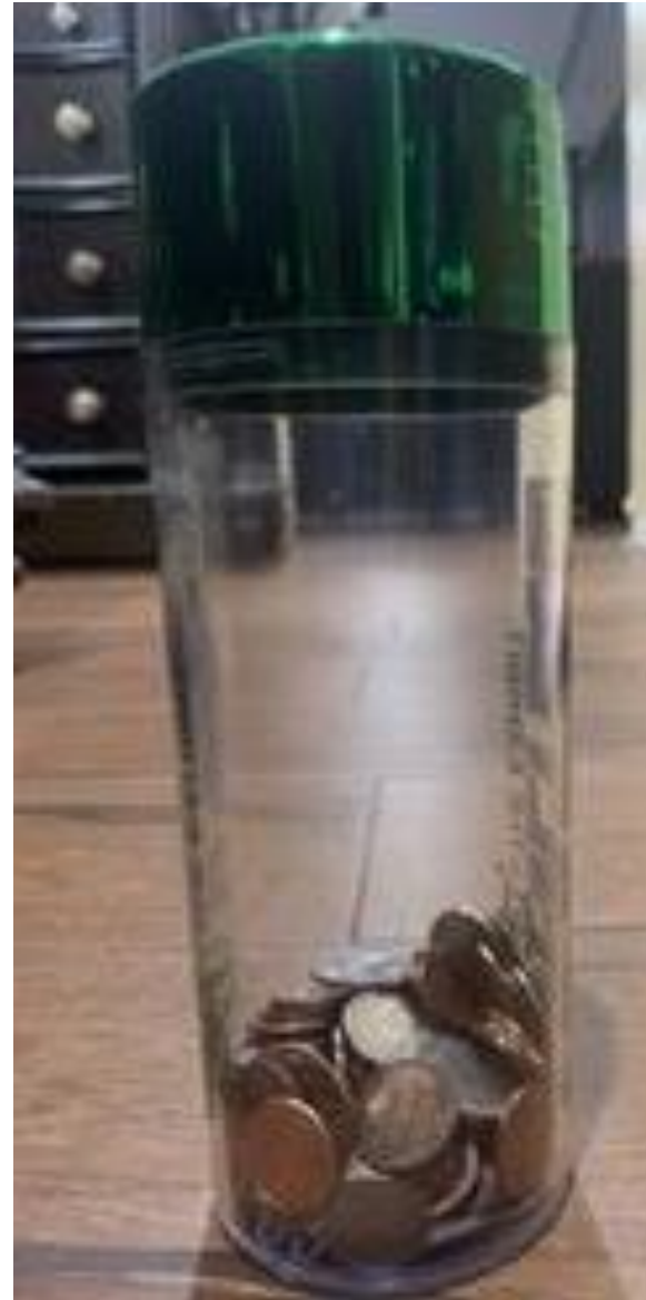
Perfume Bottle Bank